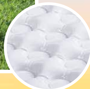
Soft Inflatable Floor