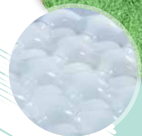
Soft Inflatable Floor